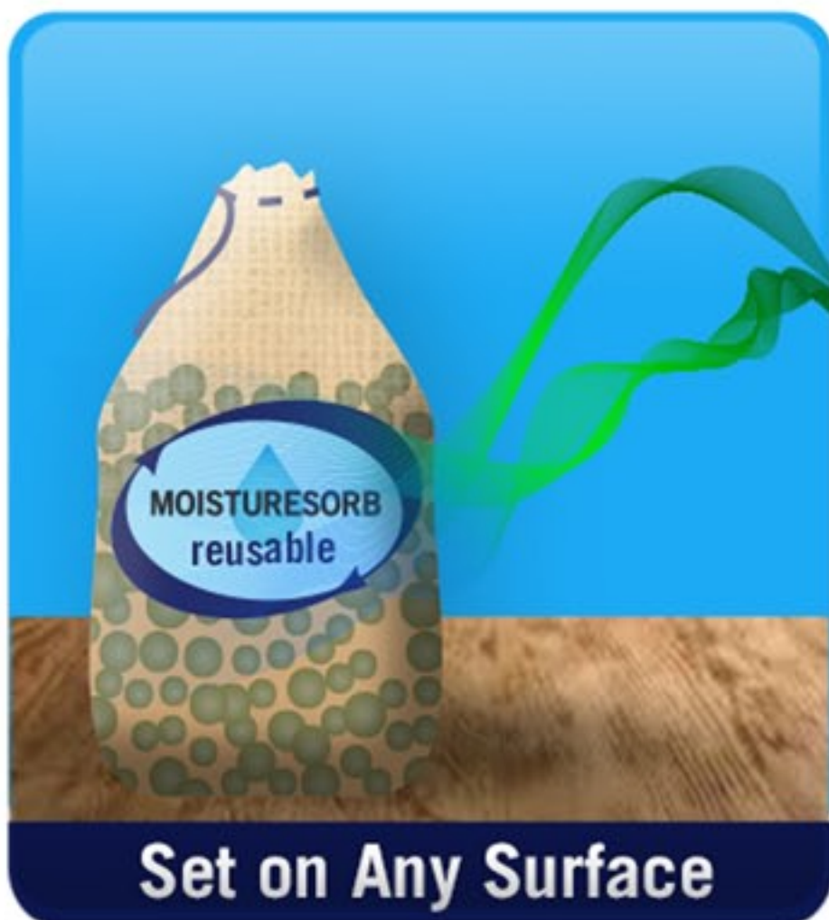
Set on Any Surface